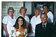
Cambridge Family Eye Care, LLC