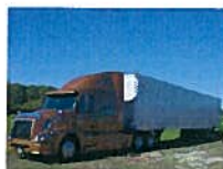
AIM TRANSPORT, INC.