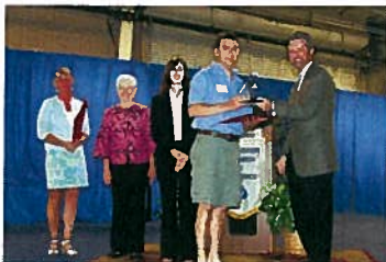
INTERSTATE CONTAINER LARGE CHAMBER BUSINESS OF THE YEAR