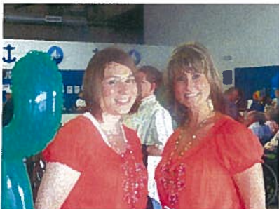
Chesapeake Woods-Genesis was there to answer all of your question for short and long term care!