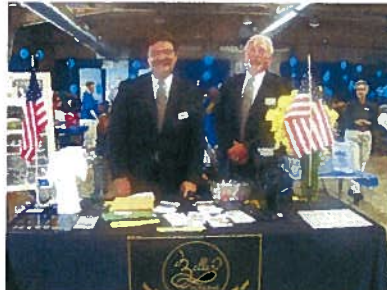
Zeller Funeral Home was there to answer all your questions and to giveaway prizes!