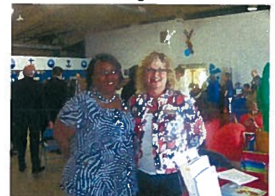
"Like a Good Neighbor State Farm is there". To help with all of your insurance needs!