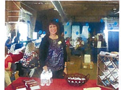
National Bank of Cambridge was there to help with all of your banking needs!