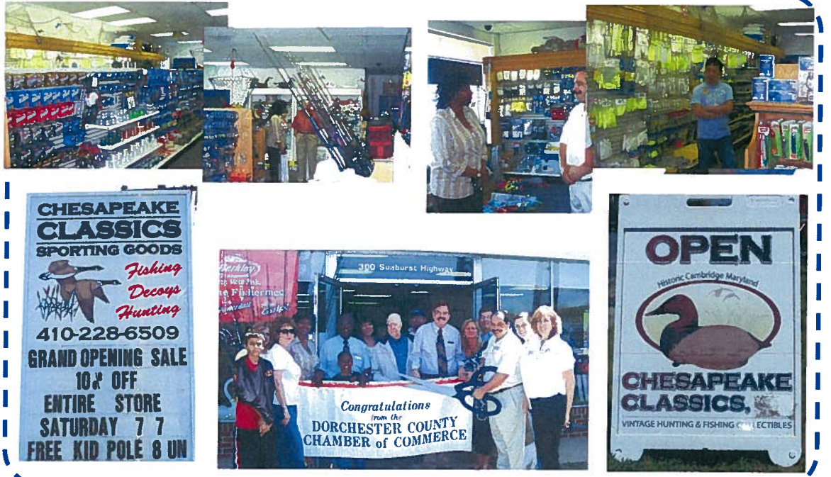
Chesapeake Classics Sporting Goods Grand Opening and Ribbon Cutting took place on Saturday, May 7, 2011. Many Chamber business members and guests enjoyed food and fun throughout the day. Specializing in fishing, hunting and sporting goods, they are located at 300 Sunburst Highway, Cambridge, MD, and are located right across the street from Dunkin' Donuts. (410)228-6509