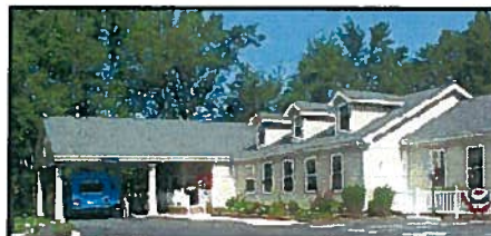
Pleasant Day Medical Adult Day Care Center 2474 Cambridge Beltway Cambridge, MD 21613 410-228-0190 www.pleasantday.com